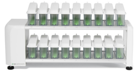
Flow meter array and DAQ unit

Modular design for easy replacement and maintenance